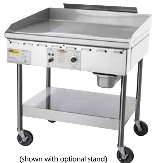
(shown with optional stand)